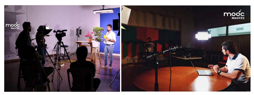
Videos recorded: Temperature

In addition, figure 2 (a) depicts the video recorded in the television studio of the "Temperature" unit, and figure 2 (b) shows the video recording of the "Agro Climate" unit. These videos were recorded by Ph. D. David Camilo Corrales.